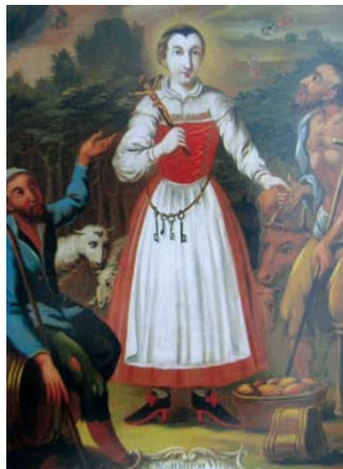
Figure 2. Saint Notburga from the 18th century. From the chapel of St. Donatus in Pavlovec, Croatia. Oil on canvas, unknown painter.

that this period saw the resurgence of the cult of St. Notburga. She was a kitchen maid who gave food to the poor and worked with them. Several miracles were reported at her shrine in Austria after her death in 1313. One striking feature of her cult, spread primarily in northern Europe, is the veneration of a servant/maid, of someone whose low social status enabled people to identify with her (19). A painting of St. Notburga from the late 18th century clearly depicts such a situation (Figure 2). The saint is shown with a radiant face and