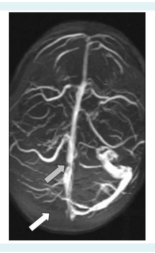
FIGURE 2. Brain magnetic resonance venography (MRV) showing no flow in the right transverse sinus and ipsilateral cortical veins (white arrow) and partially occluded flow in the superior sagittal sinus (gray arrow).

This case report presents difficulties in diagnosing the cause of postpartum headache in a patient who under-