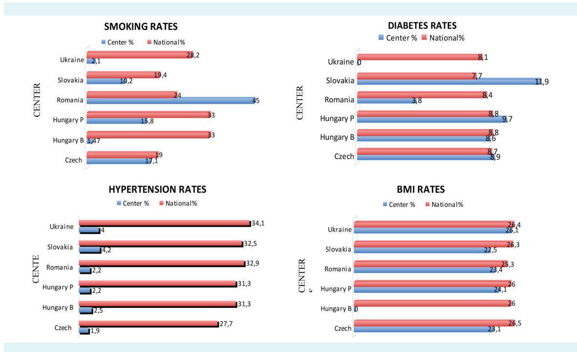
FIGURE 2. Significant historical risk factors of preterm birth (history of smoking, history of diabetes, hypertension, and body mass index) in relation to National Statistics. Very low values or missing values from the centers reflect the missing data or incomplete data collection.

Preterm birth has been recognized as a worldwide problem, particularly in LMC where its rate is around 25% compared to 5% in HIC. Moreover, in developing countries, 15% of all neonatal deaths are caused by prematurity and its