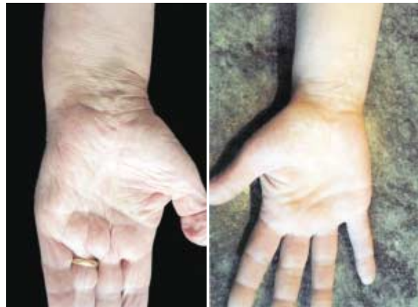
Figure 2. Cosmetic outcome after traditional open technique (left) and limited palmar incision (right) for carpal tunnel release.

Postoperative scars in the patients operated by traditional open technique for carpal tunnel release were significantly longer than the scars in the patients operated by limited palmar incision technique (Table 3). Thus, esthetic outcomes were better in the group operated by limited palmar incision technique than in traditional technique group (Table 3 and Fig. 2). Three patients in the trial group and 8 patients in the control group complained of scar or pillar tenderness ( p=0.006 ). Operation time was on average 1.6 min shorter in the trial group (Table 3).