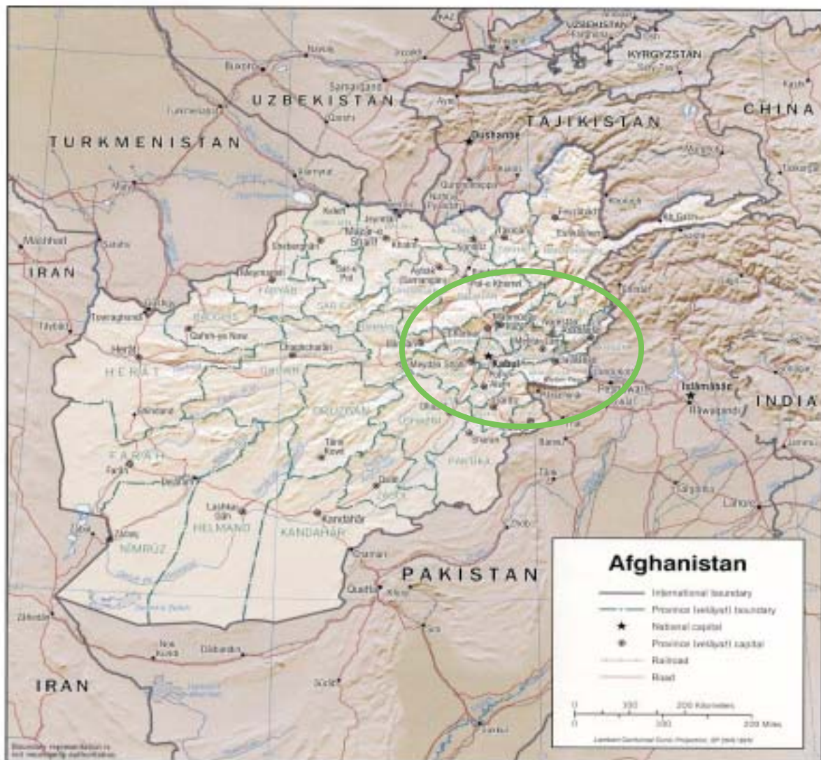
Figure 1. The areas of the Uranium Medical Research Center's (UMRC) field trips in eastern Afghanistan, 2002 (outlined).