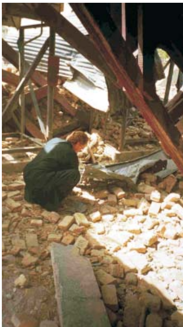
Figure 2. Soil and debris samples being collected from the bombing site by the Uranium Medical Research Center's (UMRC) field team during the second field trip outside Bibi Mahro district, Afghanistan, 2002.

Uranium levels in the soil samples from the areas of OEF bombsites were two to three times higher than worldwide concentration levels of 2-3 mg/kg. The