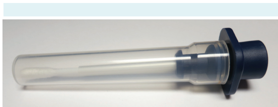
FIGURE 1. View of a Net Bio BioChipSet swab.

Collection of reference samples can be obtained from TIP victims through a simple buccal swab. Swabs were obtained from NetBio (Waltham, MA, USA). (Figure 1). These known samples can be collected by a variety of service personnel with a minimum amount of training who come in contact with the victims. Trained investigative personnel obtained samples during ongoing undercover investigative efforts. In some instances, trained undercover personnel took the buccal samples from victims with their consent. Other times, after having been informed of the process and having voluntarily consented to the sample collection, the victims stated they were more comfortable collecting the sample themselves, and were subsequently allowed to do their own buccal swab collection under the careful observation of the trained undercover personnel.