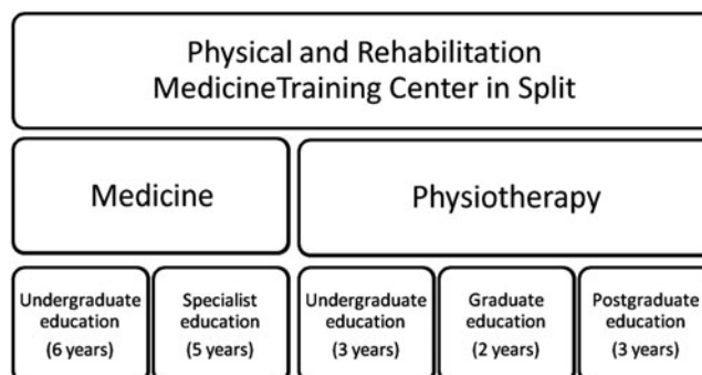
Figure 1. Structure of physical and rehabilitation medicine training center in Split.

Report on all relevant indicators related to the work of the rehabilitation team in Split and educational needs of young physicians were submitted to the Croatian Ministry of Health. On the grounds of the submitted report, accreditation for conducting long-term education of young physicians specializing in PRM was obtained in 2005. That recognition signified the establishment of a new PRM training center at the Department of Physical and Rehabilitation Medicine of the University of Split School of Medicine and at University Hospital Split. The structure of training center is shown in Figure 1.