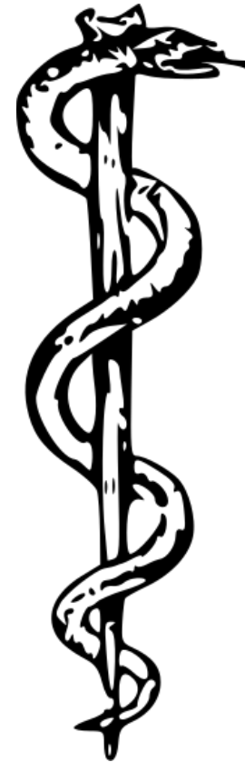
Rod (Staff) of Asclepius